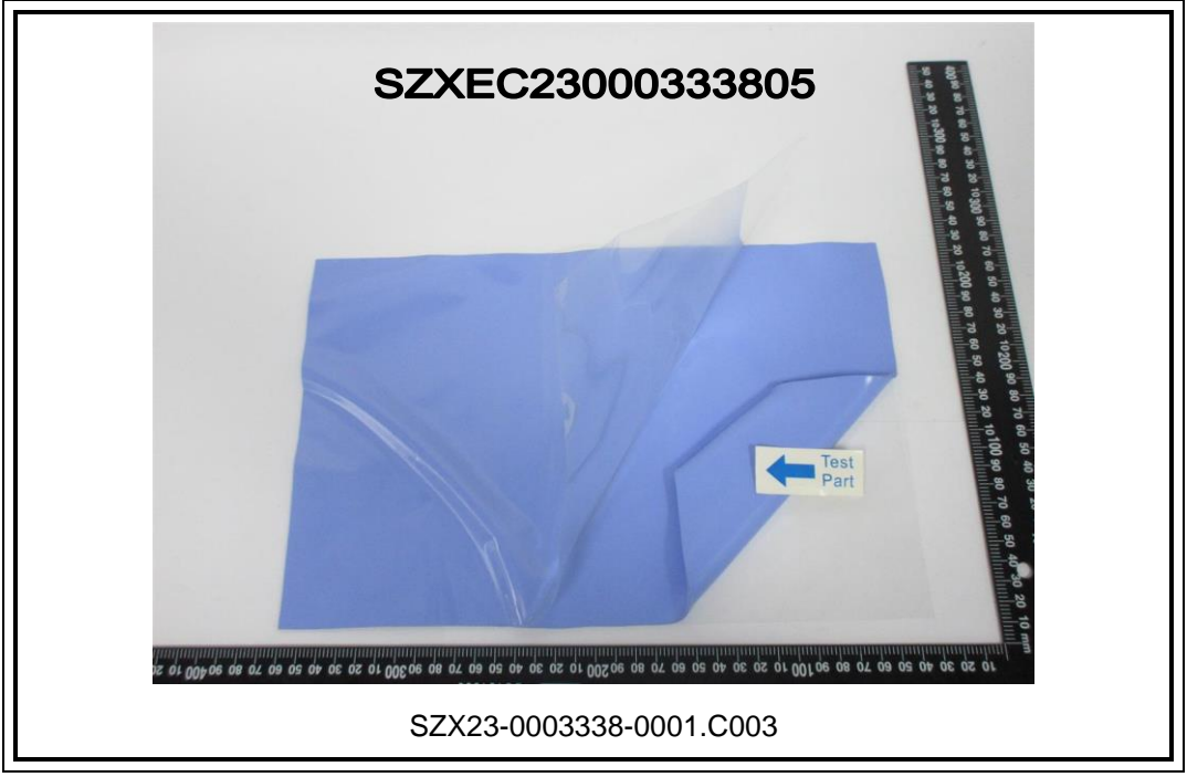
SGS authenticate the photo on original report only *** End of Report ***